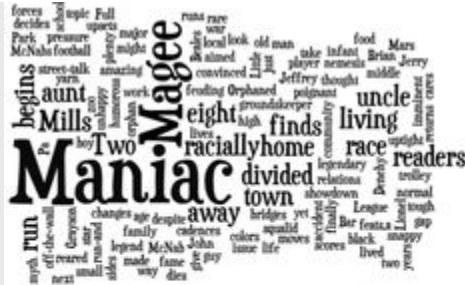
This shows how Maniac feels for Two Mills. It also shows how the whole book is and how his and Amanda feelings change throughout the whole book.