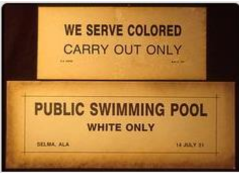
This is showing how Two Mills is segregated between blacks and whites. Also Maniac doesn't care that he lives with the Beales who are black.