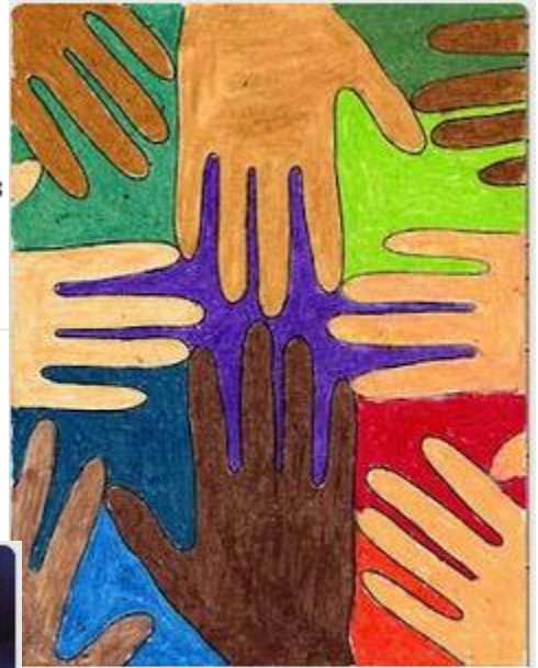
This shows how in the end of the book that no matter what color their skin is they are still the same.